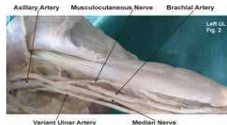
Fig. 2 : The photographic presentation of the unusual course of ulnar artery passing through the two roots of the median nerve.