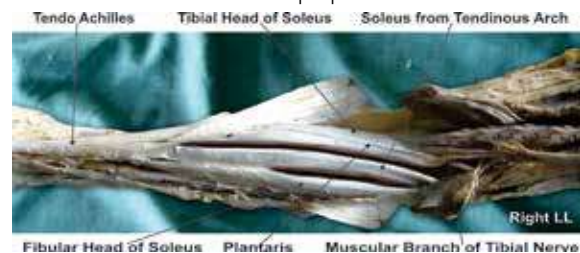
Figure 1 : Photographic presentation of the variant heads of right soleus muscle.

middle part of the posterior surface of the calcaneus bone. The pattern of vessels in the lower limb were normal. The variation was bilateral. The photographs of both the variant soleus muscles were taken for proper documentation.