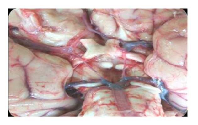
Figure 2: Showing adult type PCA PCA ≥ PCoA-30 [60%].